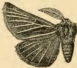
Phyllalia alboradiata ♂ ♀.

Wood-brown; head, upperside of thorax, and two first dorsal segments of abdomen fuscous brown; antennal shaft and veins 1-7